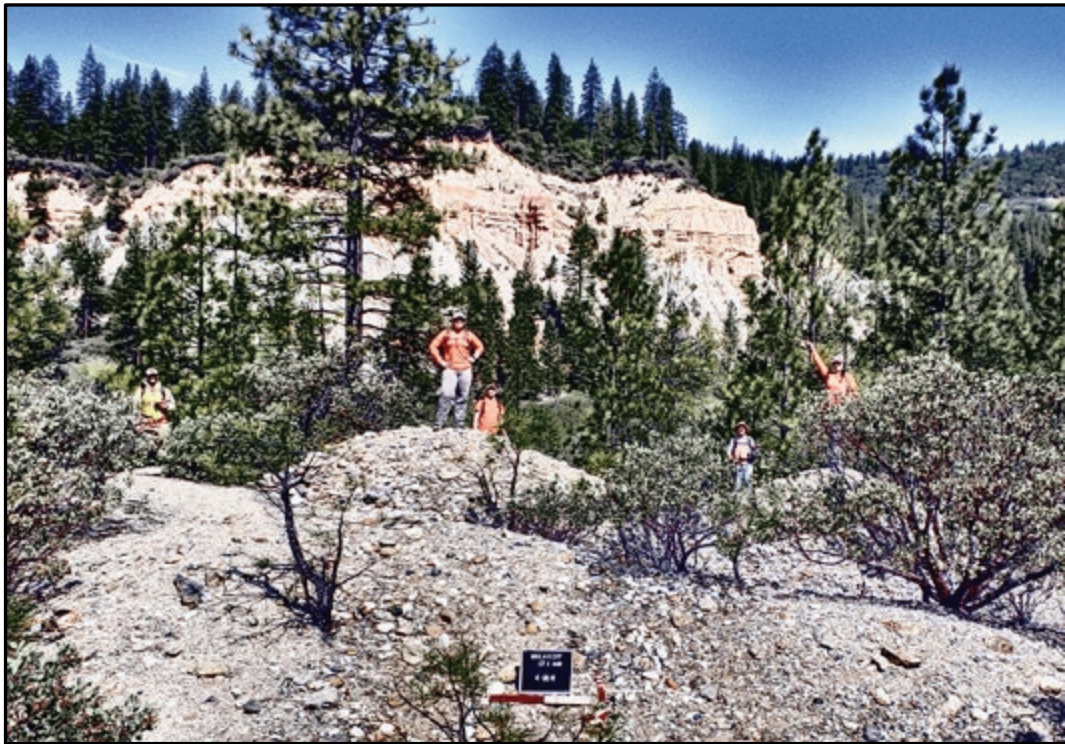
Survey crew within the Malakoff Mine pit.

The North Bloomfield Gravel Mining Company's Malakoff Mine is the best-known hydraulic mine in the world. It is on the National Register of Historic Places as the Humbug Diggins – North Bloomfield Historic District. One of its legacies is a huge and colorful open pit that now drains sediment and potentially heavy metals into the Humbug, Yuba, and Sacramento watersheds. Planning is underway to address the problem. ASC and DPR initiated a multi-year project to inventory the 3,000-acre park and evaluate the significance of identified resources. The scale of the resource also demands that a landscape study be carried out. ASC began the inventory phase, relying heavily on prior surveys and aerial LIDAR. Using our expertise with gold-mining resources, we have reconstructed the complex evolution of the large Malakoff operation from its inception in the 1850s by French-speaking immigrants until its abandonment in the early 20th century, long after the famous Sawyer Decision of 1884, which prohibited hydraulic mines from dumping debris into the valley.