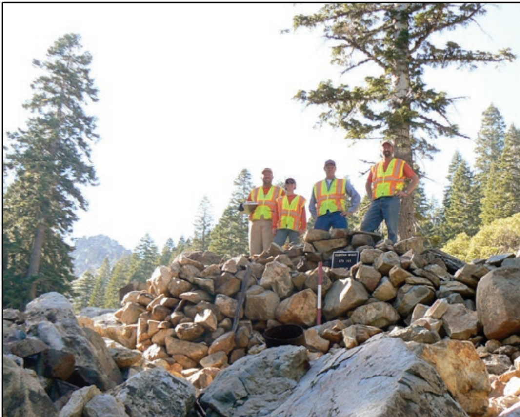
ASC survey crew below "Gold Mountain".

Eureka Mills was a small gold-mining town in the high Sierra Nevada during the last quarter of the 19th-century. It began when the London-based Plumas Eureka Gold Mining Company consolidated Gold Rush-era claims, opened a new mine portal into Eureka Peak, and constructed the Mammoth Mill near the adit. The small town complete with numerous family dwellings, businesses and schoolhouse formed around the Company's buildings and crowded boarding house. Within a decade a new stamp mill built downslope replaced the Mammoth and another town, Johnsville) developed nearby. Eureka Mills slowly declined and when the company halted operations by the end of the century the town was abandoned. DPR elected to thin the forest that has been establishing in the ruins of Eureka Mills, and ASC participated in the project by subsequently recording the remains and helping design an interpretive panel. The project rekindled the park association to lead new tours to the site, and monitor it closely for signs of vandalism. ASC designed a new interpretive panel that has been installed at the site.