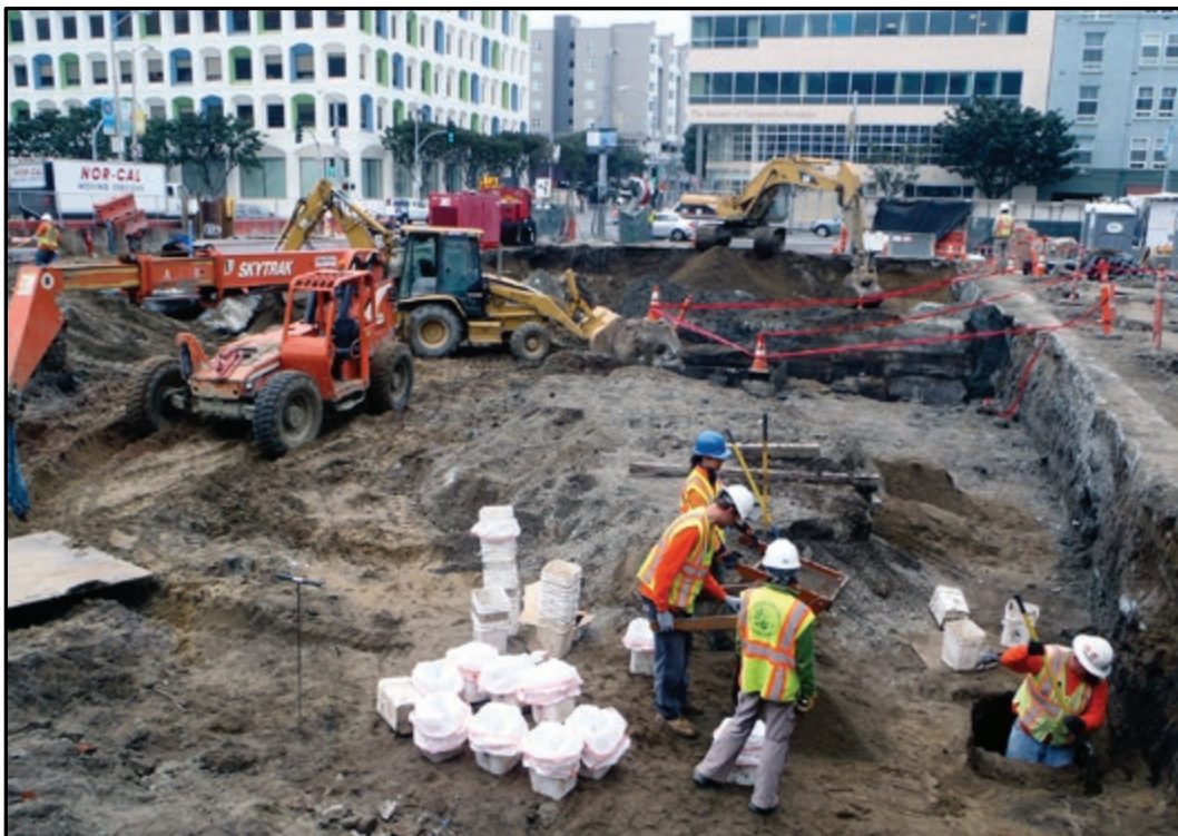
Excavation of a historic-era feature.